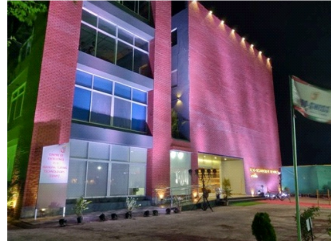
TE CONNECTIVITY - SHIRWAL